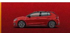
Velvet Red Metallic (+$1,000)