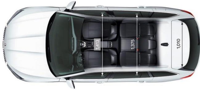
Technical drawing shown is Octavia Style