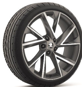
19" Vega alloy wheels