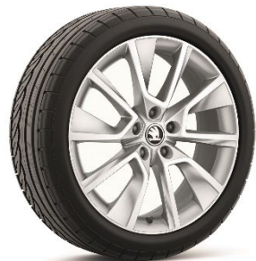
18" Braga alloy wheels