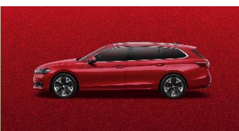
Carmine Red Metallic (+$1,000)