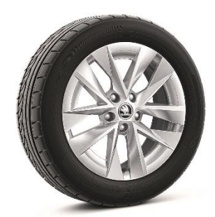
17" Rotare alloy wheels