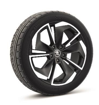
18" Comet alloy wheels

Śkoda reserves the right to make changes to specifications, colours and prices without notice. Whilst we make every effort to ensure that specifications are accurate at the time of publication, you should always check with your Škoda dealer for the latest information.