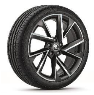
19" Vega alloy wheels

Škoda reserves the right to make changes to specifications, colours and prices without notice. Whilst we make every effort to ensure that specifications are accurate at the time of publication, you should always check with your Škoda dealer for the latest information.