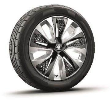
18" Procyon alloy wheels