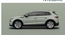
Timiano Green Metallic