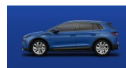
Energy Blue Uni

Škoda reserves the right to make changes to specifications, colours and prices without notice. Whilst we make every effort to ensure that specifications are accurate at the time of publication, you should always check with your Škoda dealer for the latest information.