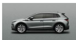
Smokey Diamond Silver Metallic