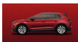
Velvet Red Metallic (+$1,000)