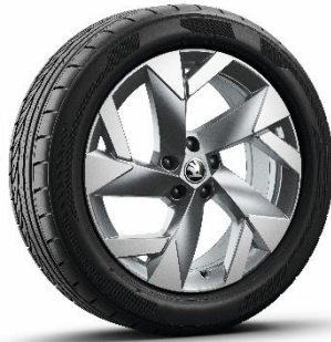
19" 'Tirsuli' anthracite alloy