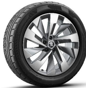
19" 'Halti' anthracite alloy