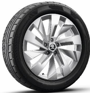
19" 'Rapeto' polished silver alloy