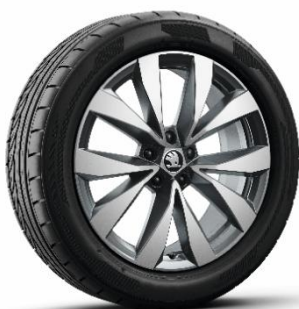
19" 'Lefka' anthracite alloy