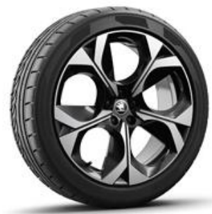
20" 'Elias' matte black alloy