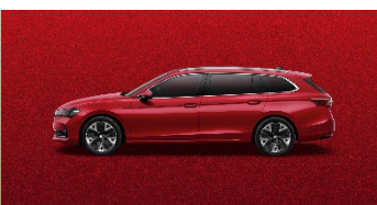
Carmine Red Metallic (+$1,000)