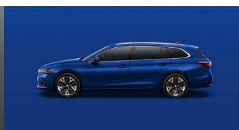
Energy Blue Uni