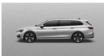
Pebble Silver Metallic