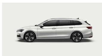
Pure White Uni