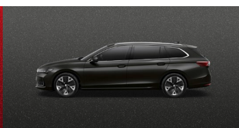
Ebony Black Metallic