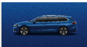
Cobalt Blue Metallic