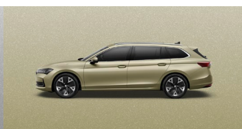
Ice Tea Yellow Metallic