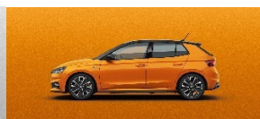
Phoenix Orange Metallic (+$1,000)