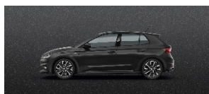
Magic Black Metallic