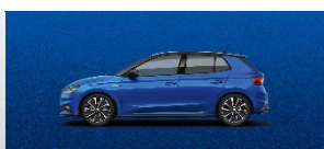
Race Blue Metallic