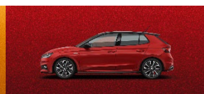
Velvet Red Metallic (+$1,000)