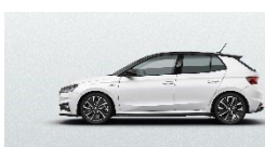
Moon White Metallic

Monte-Carlo is registered trademark by Monaco Brands