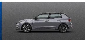
Graphite Grey Metallic