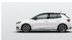
Moon White Metallic

ŠKODA Monte-Carlo is registered trademark by Monaco Brands