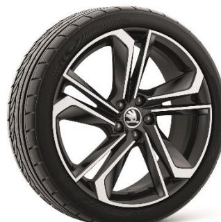
18" Libra alloy wheels