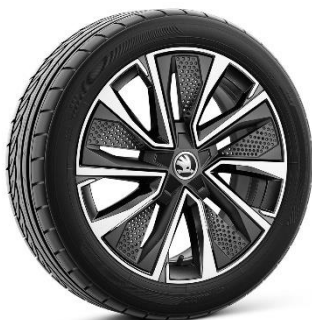
17" Procyon alloy wheels