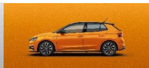
Phoenix Orange Metallic (+$1,000)