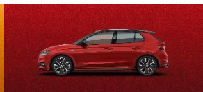
Velvet Red Metallic (+$1,000)