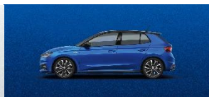
Race Blue Metallic