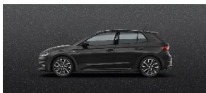
Magic Black Metallic