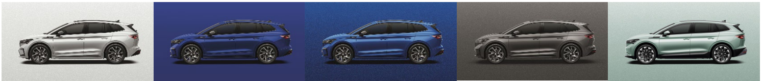
Moon White Metallic