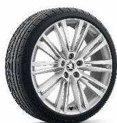
19" 'CANOPUS' Alloy