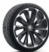
19" 'SUPERNOVA' Alloy