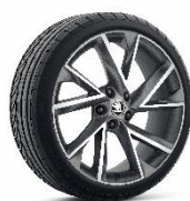
19" 'VEGA' Alloy