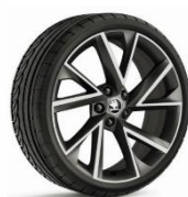
19" 'VEGA' Alloy