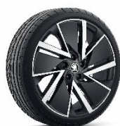
19" 'VEGA AERO' Alloy