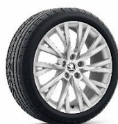
18" 'ANTARES' Alloy