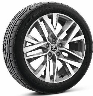
18" Lerna anthracite alloy wheels