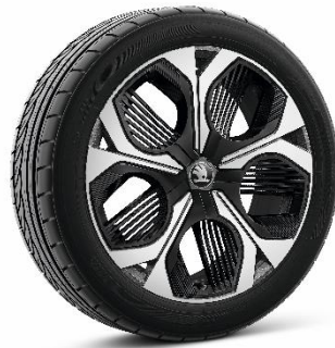
19" Elias anthracite alloy wheels