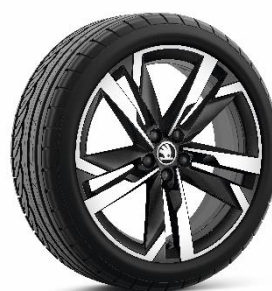
18" Ursa MC black, diamond cut alloys