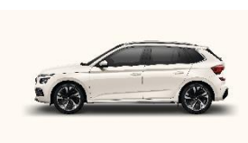
Candy White Metallic