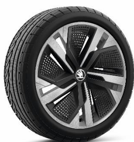
18" Ursa aero silver alloys with aero trim