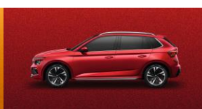
Velvet Red Metallic (+$1,000)