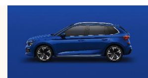
Energy Blue Metallic