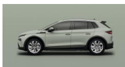
Timiano Green Metallic