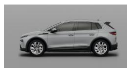
Steel Grey Uni