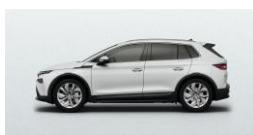
Moon White Metallic