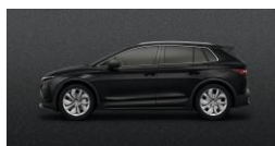
Magic Black Metallic