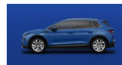
Energy Blue Uni

Škoda reserves the right to make changes to specifications, colours and prices without notice. Whilst we make every effort to ensure that specifications are accurate at the time of publication, you should always check with your Škoda dealer for the latest information.