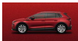
Velvet Red Metallic (+$1,000)