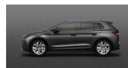
Graphite Grey Metallic