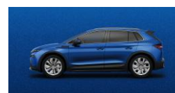
Race Blue Metallic