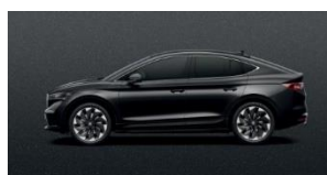
Magic Black Metallic