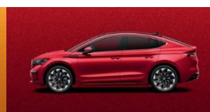
Velvet Red Metallic (+$1,000)