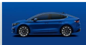
Energy Blue Solid