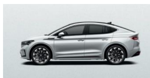
Moon White Metallic