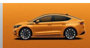
Phoenix Orange Metallic (+$1,000)