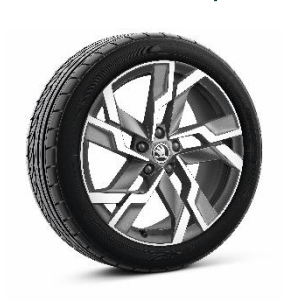
19" Sagitarius aero alloy wheels

Škoda reserves the right to make changes to specifications, colours and prices without notice. While we make every effort to ensure that specifications are accurate at the time of publication, you should always check with your Škoda dealer for the latest information.