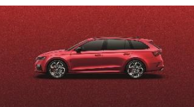
Velvet Red Metallic (+$1,000)