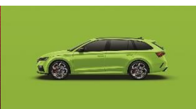
Mamba Green Uni