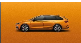
Phoenix orange Metallic (+$1,000)