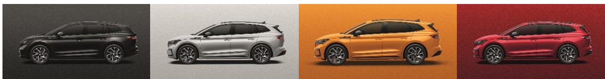
Magic Black Metallic