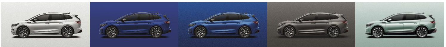
Moon White Metallic