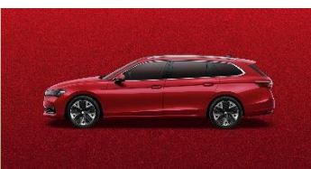
Carmine Red Metallic (+$1,000)