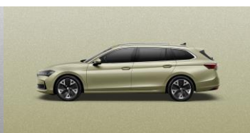
Ice Tea Yellow Metallic