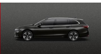
Ebony Black Metallic