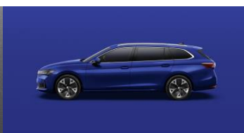
Energy Blue Uni