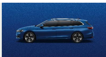
Cobalt Blue Metallic