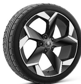
19" Torcular alloy wheels

Škoda reserves the right to make changes to specifications, colours and prices without notice. Whilst we make every effort to ensure that specifications are accurate at the time of publication, you should always check with your Škoda dealer for the latest information.