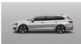
Pebble Silver Metallic