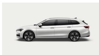
Pure White Uni