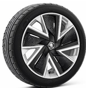
18" Bosona alloy wheels