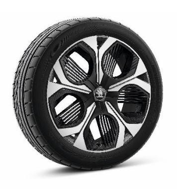
19" Elias anthracite alloy wheels

✓ = Standard -- = Not available Updated May 20