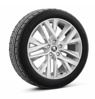
18" Lerna silver alloy wheels (Launch Edition)