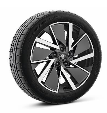
18" Vega Aero black alloy wheels