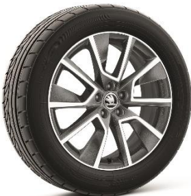
17" Braga alloy wheels