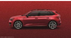
Velvet Red Metallic (+$1,000)