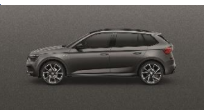
Graphite Grey Metallic