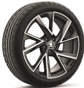
18" Vega alloy wheels

Škoda reserves the right to make changes to specifications, colours and prices without notice. Whilst we make every effort to ensure that specifications are accurate at the time of publication, you should always check with your Škoda dealer for the latest information.