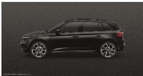
Magic Black Metallic