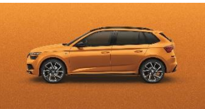
Phoenix Orange Metallic (+$1,000)