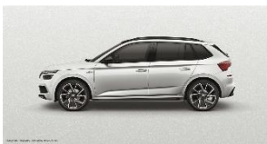
Moon White Metallic