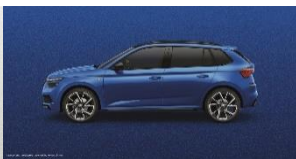
Race Blue Metallic