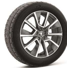
17" 'BRAGA' Black Alloys