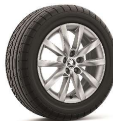
16" 'ALARIS' Alloys