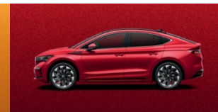
Velvet Red Metallic (+$1,000)