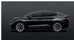
Magic Black Metallic