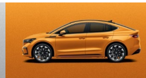
Phoenix Orange Metallic (+$1,000)