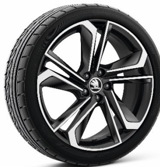
18" Libra black alloy wheels (optional)

ŠKODA reserves the right to make changes to specifications, colours and prices without notice. While we make every effort to ensure that specifications are accurate at the time of publication, you should always check with your ŠKODA dealer for the latest information.