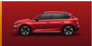
Velvet Red Metallic (+$1,000)