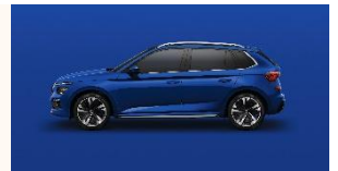
Energy Blue Metallic