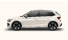
Candy White Metallic