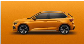
Phoenix Orange Metallic (+$1,000)