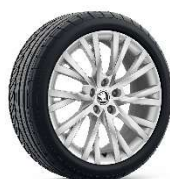
18" 'ANTARES' Alloy