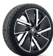
19" 'VEGA AERO' Alloy