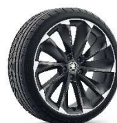
19" 'SUPERNOVA' Alloy