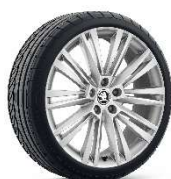
19" 'CANOPUS' Alloy