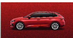
Velvet Red Metallic (+$1,000)