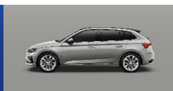
Steel Grey Uni