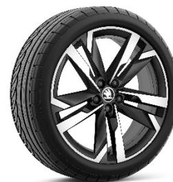
18" Ursa MC black, diamond cut alloy wheels