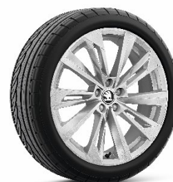
18" Fornax alloy wheels