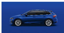
Energy Blue Uni