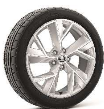
19" 'TRIGLAV' Alloys