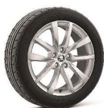
18" 'ELBRUS' Alloys