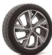
19" 'TRIGLAV' Black Alloys