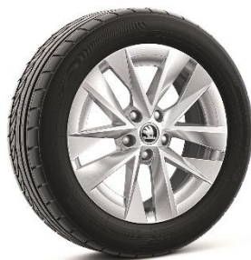
17" Rotare alloy wheels