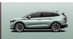
Arctic Silver Metallic