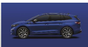
Energy Blue Solid