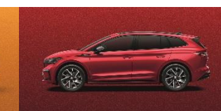
Velvet Red Metallic (+$1,000) (Available on Sportline Max only)