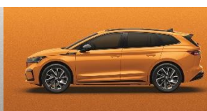
Phoenix Orange Metallic (+$1,000) (Available on Sportline Max only)