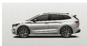
Moon White Metallic