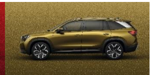
Bronx Gold Metallic