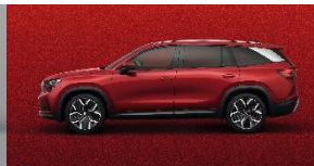
Velvet Red Metallic (+$1,000)