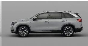
Steel Grey Uni