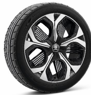
19" Elias anthracite alloy wheels