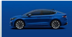
Energy Blue Solid