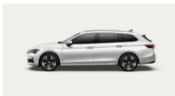
Pure White Uni