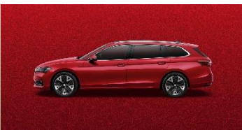
Carmine Red Metallic (+$1,000)