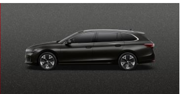
Ebony Black Metallic