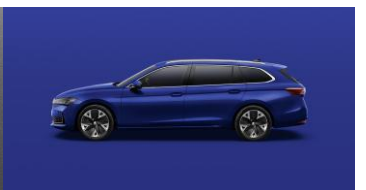
Energy Blue Uni