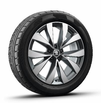
19" 'Lefka' anthracite alloy

Škoda reserves the right to make changes to specifications, colours and prices without notice. Whilst we make every effort to ensure that specifications are accurate at the time of publication, you should always check with your Škoda dealer for the latest information.