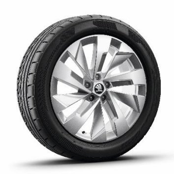
19" 'Rapeto' polished silver alloy