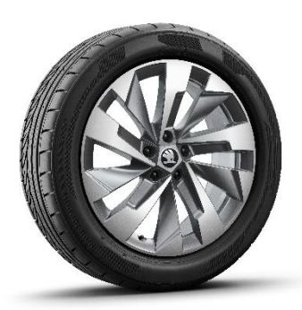
19" 'Halti' anthracite alloy