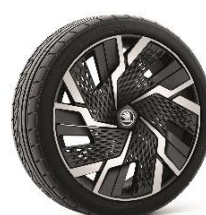
20" 'SAGITARIUS' Alloys

ŠKODA reserves the right to make changes to specifications, colours and prices without notice. Whilst we make every effort to ensure that specifications are accurate at the time of publication, you should always check with your ŠKODA dealer for the latest information.