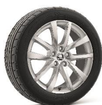
18" 'ELBRUS' Alloys