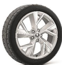
19" 'TRIGLAV' Alloys