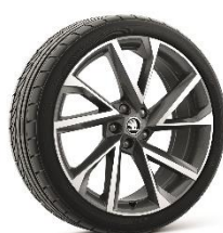
20" 'VEGA' Alloys