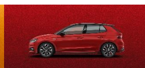
Velvet Red Metallic (+$1,000)