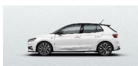
Moon White Metallic

ŠKODA Monte-Carlo is registered trademark by Monaco Brands