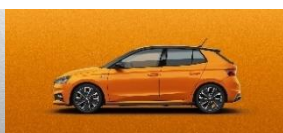
Phoenix Orange Metallic (+$1,000)