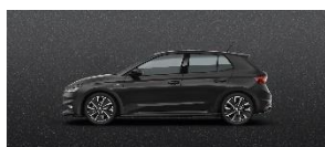
Magic Black Metallic