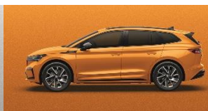
Phoenix Orange Metallic (+$1,000)