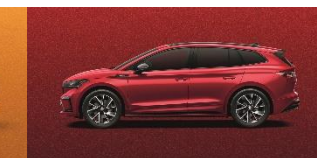
Velvet Red Metallic (+$1,000)