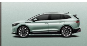
Arctic Silver Metallic